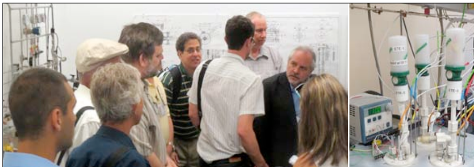
Left: Conference participants discussing a point during one of the laboratory tours. Right: Three LENR electrochemical cells in operation within an insulated calorimeter.

Tours of the SKINR laboratories in both the Department of Physics and the Department of Electrical Engineering, as well as the reactor, were conducted during ICCF18. Capabilities, which ranged from materials preparation and characterization to electrochemical and gas loading LENR experiments, were on display. It is clear that SKINR has much of both the scientific expertise and the modern equipment needed to grapple with the multi-disciplinary challenges of LENR. Because of SKINR and related capabilities, the University of Missouri has the most comprehensive academic program to attack the riddle of what is happening in LENR experiments. It is a welcome evolution for the field so that, once again, there are major capabilities for LENR research at a large research university.