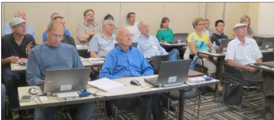
Some of the participants in the National Instruments Workshop after ICCF18.