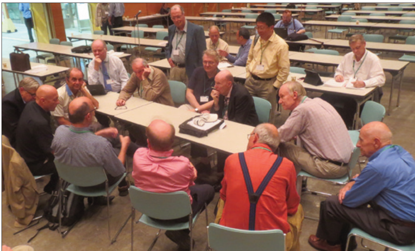
Figure 2. Photograph taken during the unscheduled discussion of LENR theories at ICCF20.

It must be noted that there are many theories of the mechanisms that cause LENR, which were not represented at ICCF20. That is understandable, of course, since not all theorists can attend all LENR meetings. However, it is important to remember that the theories, which were aired at ICCF20 and described above, are set in a much larger and competi-